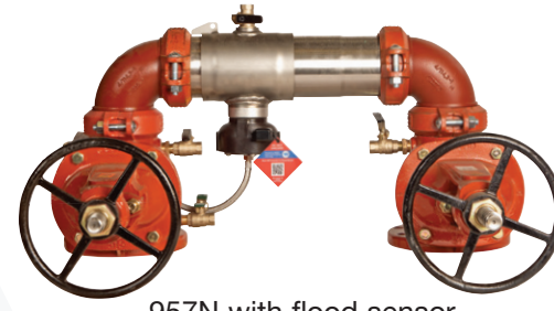
957N with flood sensor