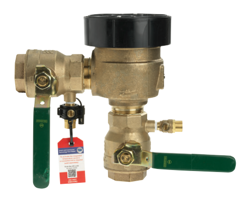
LF800M4FR with freeze sensor