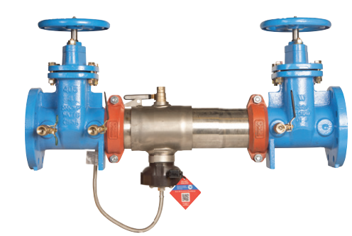
957 with flood sensor