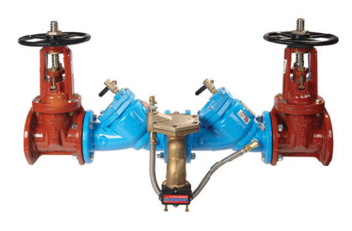
LF909 with flood sensor