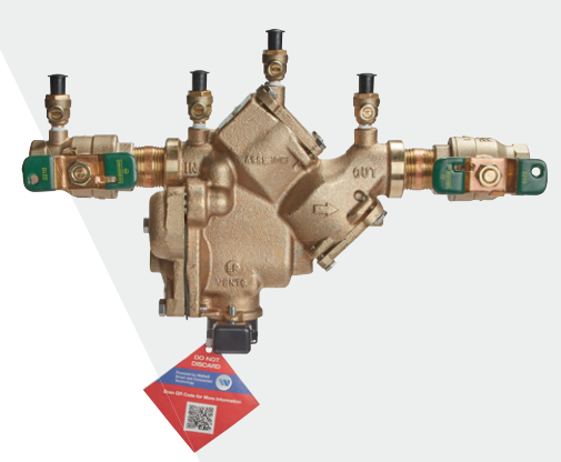
LF909 with flood sensor