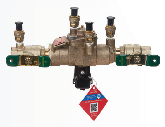
LF009-QT with flood sensor