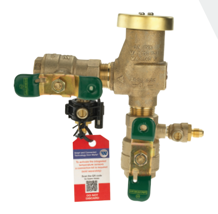
LF800M4QT with freeze sensor